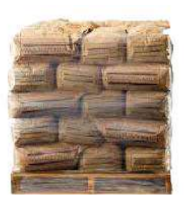
1920 lb - 2000 lb Pallets